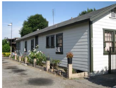
Holiday lights removed, new paint applied, and vegetation trimmed.