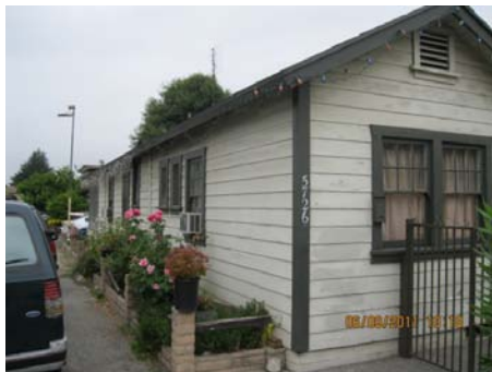
Christmas lighting, chipping paint, and overgrown vegetation.

The case was closed June 27 after community preservation staff conducted an inspection indicating compliance. Following are before and after photos.