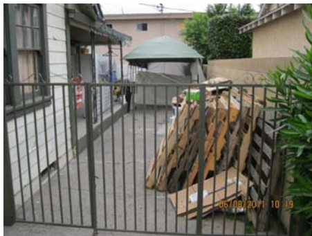
Accumulation of junk, trash and debris.